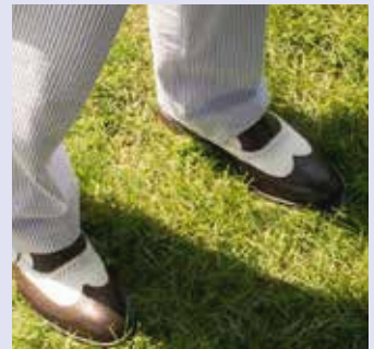
My shoes at the Lamb Roast, June 2016

There is much more to share—two of our faculty were recognized in the Associated Student Government Faculty Honor Roll, two more won prestigious fellowships from the Guggenheim and Loeb Foundations, books and articles were published, an accelerated Greek class was pioneered, festivals and theatricals celebrated... Read on and see all we have been up to!