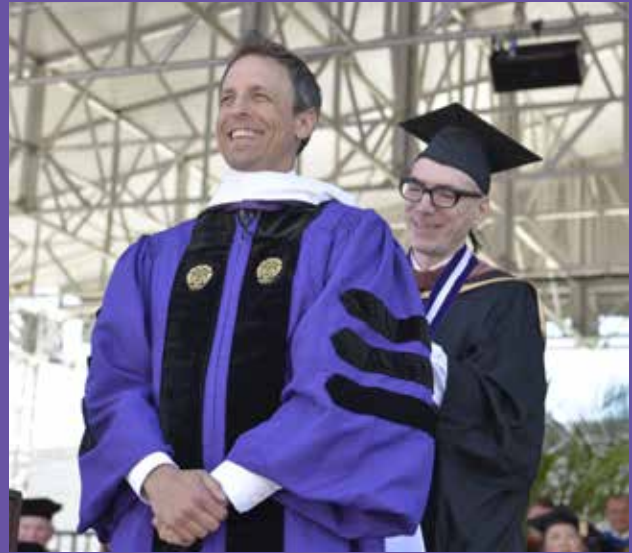
Commencement speaker, Seth Meyers, receives an honorary degree