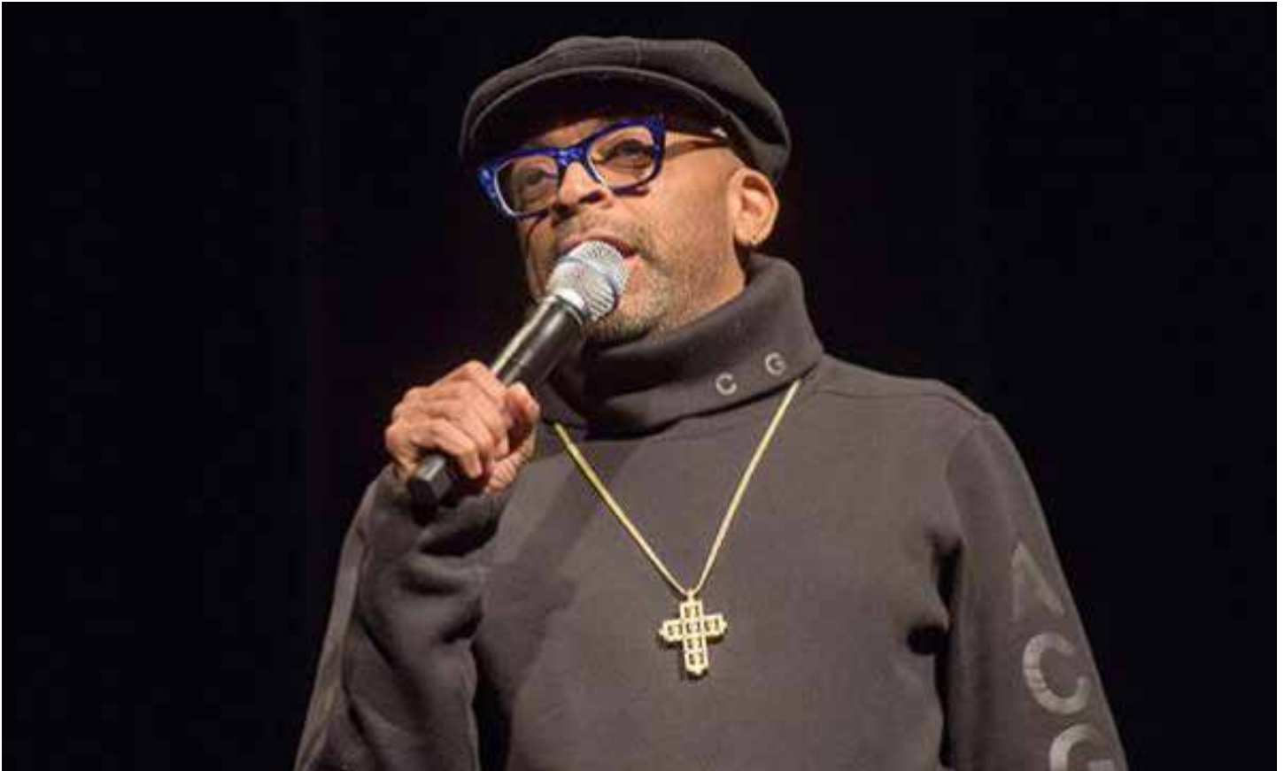
Spike Lee